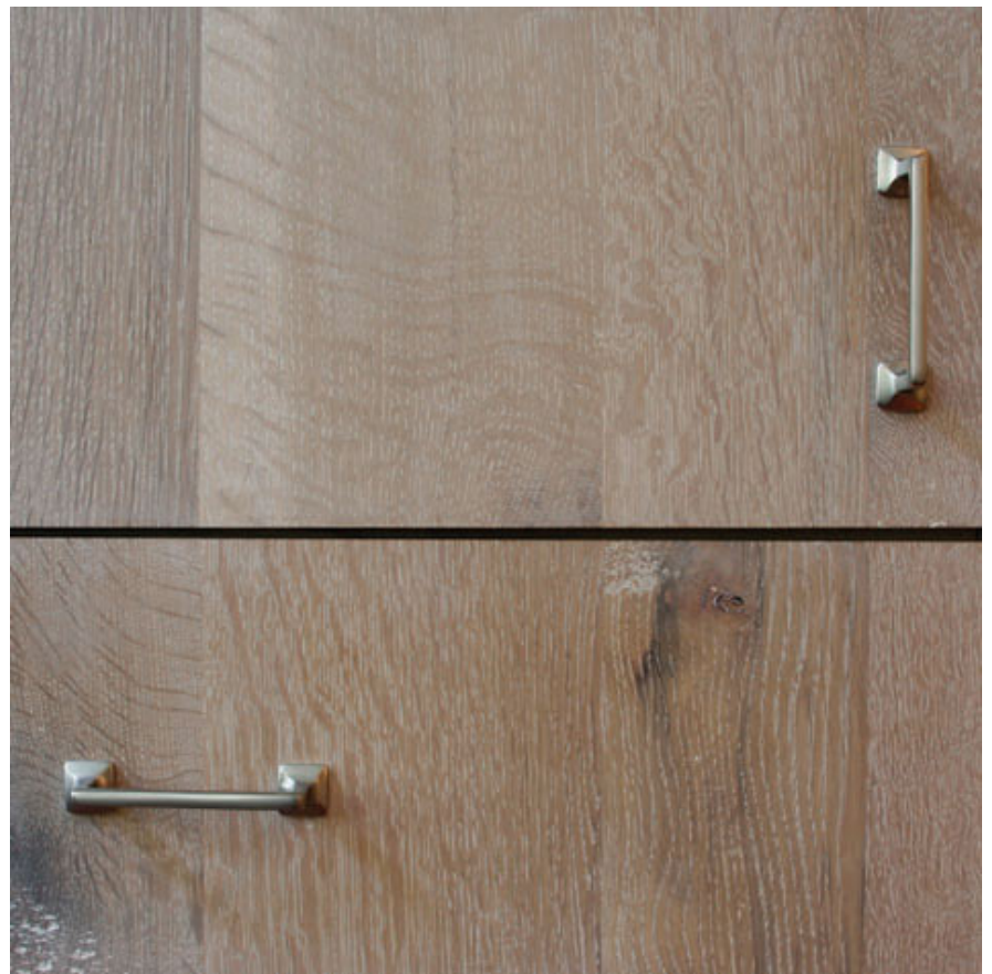
Image to the right: Up close view of the kitchen cabinets with the wax finish that our friend Skylar Morgan helped us with.