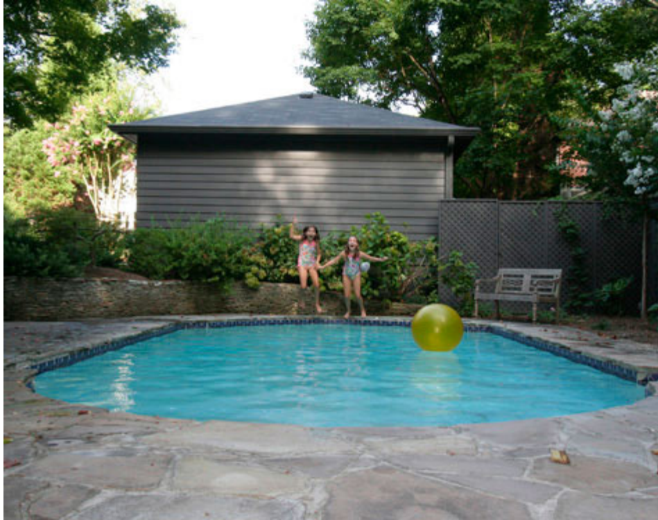
Image above: We love our “cement pond” and so do our daughter and her friends! The pool area needs a good bit of renovating, but in the meantime, we really enjoy it during the summer.