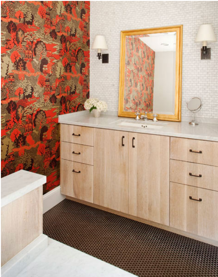
Image to the left: We designed the master bath to include the same white oak cabinets as the kitchen and an Ann Saks bronze penny-round floor tile, but I was feeling it was a bit blah. I was showing a sample of the bold Osborne & Little chinoiserie wallpaper to a friend when I realized it could work as an accent wall in our bathroom.

Image to the right: The master bath shower has a little square opening that allows for a view of the back yard.