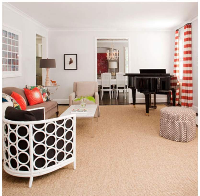
Image to the right: My favorite new piece in the living room is the Maguire Laura Kirar chair; it's really comfortable. We roll over the oval ottoman from the fireplace (it's on casters), and it's even more comfortable. The chair's covered in a Perennials dark brown outdoor fabric. It was a floor model — a great find. And it complements the traditional camel-back sofa, which belonged to my grandmother. We recovered it in a Dogwood Fabric cotton velvet.

Image to the left: The niche in the dining room was existing, and it was exactly the right width for the Oly Studio Elizabeth buffet that I'd been considering for years; it works well for stylish storage in a small space. We painted the dining chairs white and recovered them; they're hand-me-downs from my parents.