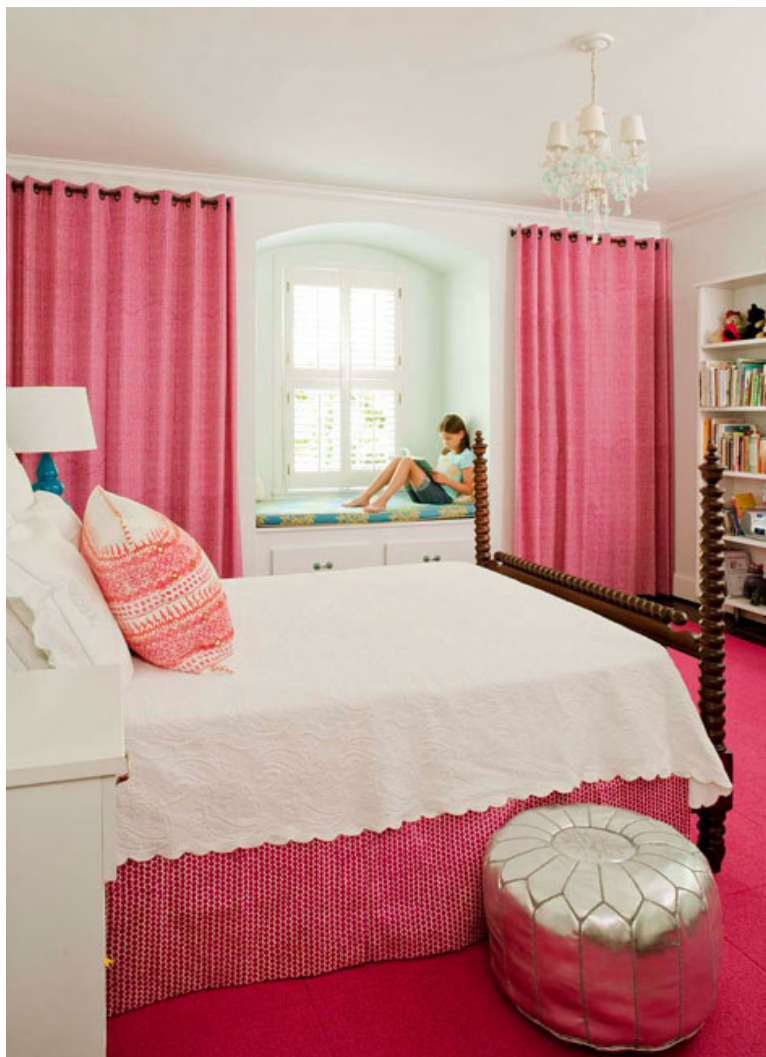
Image above: In our daughter's room, we took off the closet doors and had bright and sturdy drapes made by Drape 98 Express with Hable Construction's Magenta Beads canvas. The big bolster pillow on the bed is from John Robshaw .

We'd been looking for a small home for our family of three. We found it within four miles of our office and walking distance to our daughter's school. And close to other things we love about in-town Atlanta: museums, parks, bike trails, restaurants and shopping. The home was designed in 1939 by architect Clement Ford, was built as a one-story brick cottage and with the exception of one modest interior renovation, it remained unchanged until our purchase in 2008.