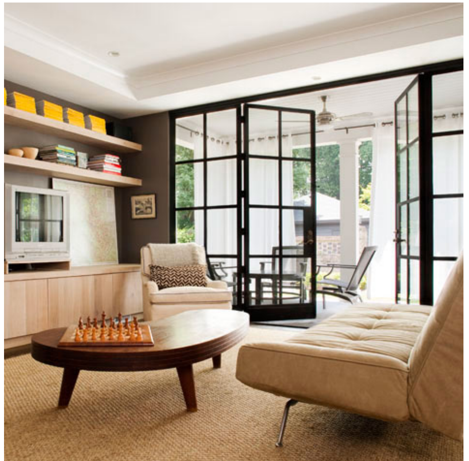
Image to the right: We replaced old rotted-wood French doors with new custom steel doors (they were made in Smyrna, Georgia, by Rod Gibson) that open up the den to the back porch and turn it into one big room when the weather's nice.