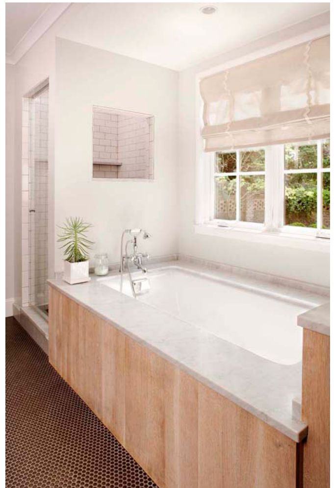
Image to the right: The master bath shower has a little square opening that allows for a view of the back yard.

Image to the left: We designed the master bath to include the same white oak cabinets as the kitchen and an Ann Saks bronze penny-round floor tile, but I was feeling it was a bit blah. I was showing a sample of the bold Osborne & Little chinoiserie wallpaper to a friend when I realized it could work as an accent wall in our bathroom.