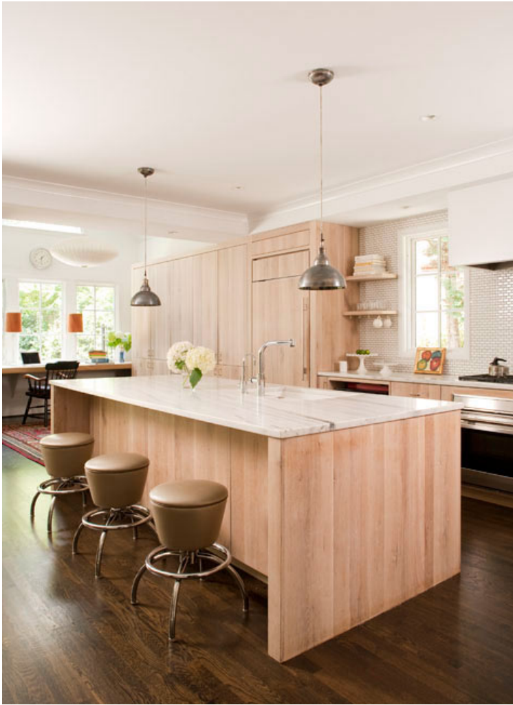
Image to the left: View of the kitchen. Georgia Cherokee marble countertops quarried in N. Georgia.