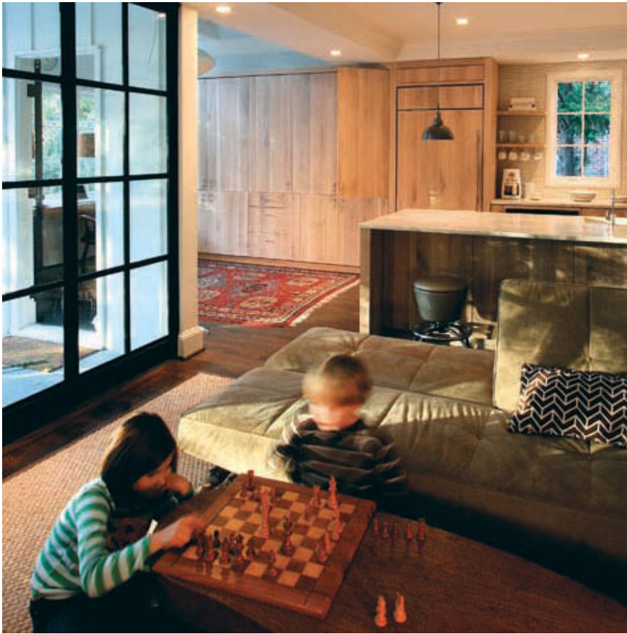
Image to the left: Late afternoon sun coming through the steel doors into the den and kitchen while kids play chess with handmade wood pieces that belonged to my dad.