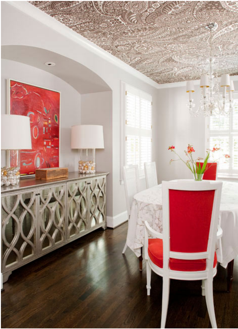
Image to the left: The niche in the dining room was existing, and it was exactly the right width for the Oly Studio Elizabeth buffet that I'd been considering for years; it works well for stylish storage in a small space. We painted the dining chairs white and recovered them; they're hand-me-downs from my parents.

Image to the right: My favorite new piece in the living room is the Maguire Laura Kirar chair; it's really comfortable. We roll over the oval ottoman from the fireplace (it's on casters), and it's even more comfortable. The chair's covered in a Perennials dark brown outdoor fabric. It was a floor model — a great find. And it complements the traditional camel-back sofa, which belonged to my grandmother. We recovered it in a Dogwood Fabric cotton velvet.