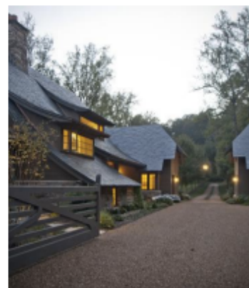
(L-R: Rozanne Jackson Interiors, Square Feet Studio, Pursley Dixon Architecture Inc.)

ATLANTA – On the heels of the 2014 Southeast Designers and Architect of the Year Awards Gala, where more than 350 guests gathered at the Atlanta Symphony Associates’ Decorators’ Show House & Gardens, ADAC and VERANDA are proud to announce the 2014 Award Winners: